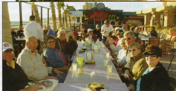
Left photo: SCOV RV Club members dine at Rocky Point, Mexico.

Sundowners RV Club. They are so flexible and roll with the punches. They deal with adversity well but are thrilled when they find an RV park that isn't located next to a railroad track. Members' potluck dishes are often culinary delights!"