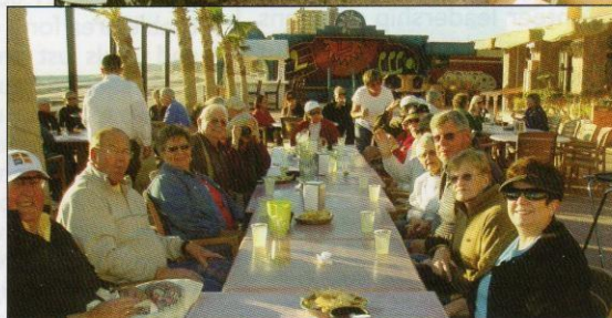
Left photo: SCOV RV Club members dine at Rocky Point, Mexico.

Sundowners RV Club. They are so flexible and roll with the punches. They deal with adversity well but are thrilled when they find an RV park that isn't located next to a railroad track. Members' potluck dishes are often culinary delights!"